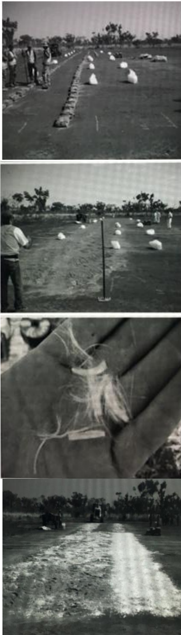
Figure 4. Phases of airport matrix soil stabilization by polypropylene fibers and cement

In recent years, combinations of fibers and previous stabilizers such as cement has been very popular such that in Australia, soil engineers were able to stabilize a runway matrix.