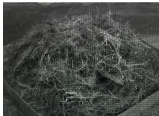
Figure3. Natural Palm Fibers